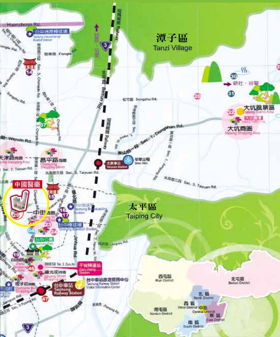
— TAICHUNG CITY SIGHTSEEING MAP